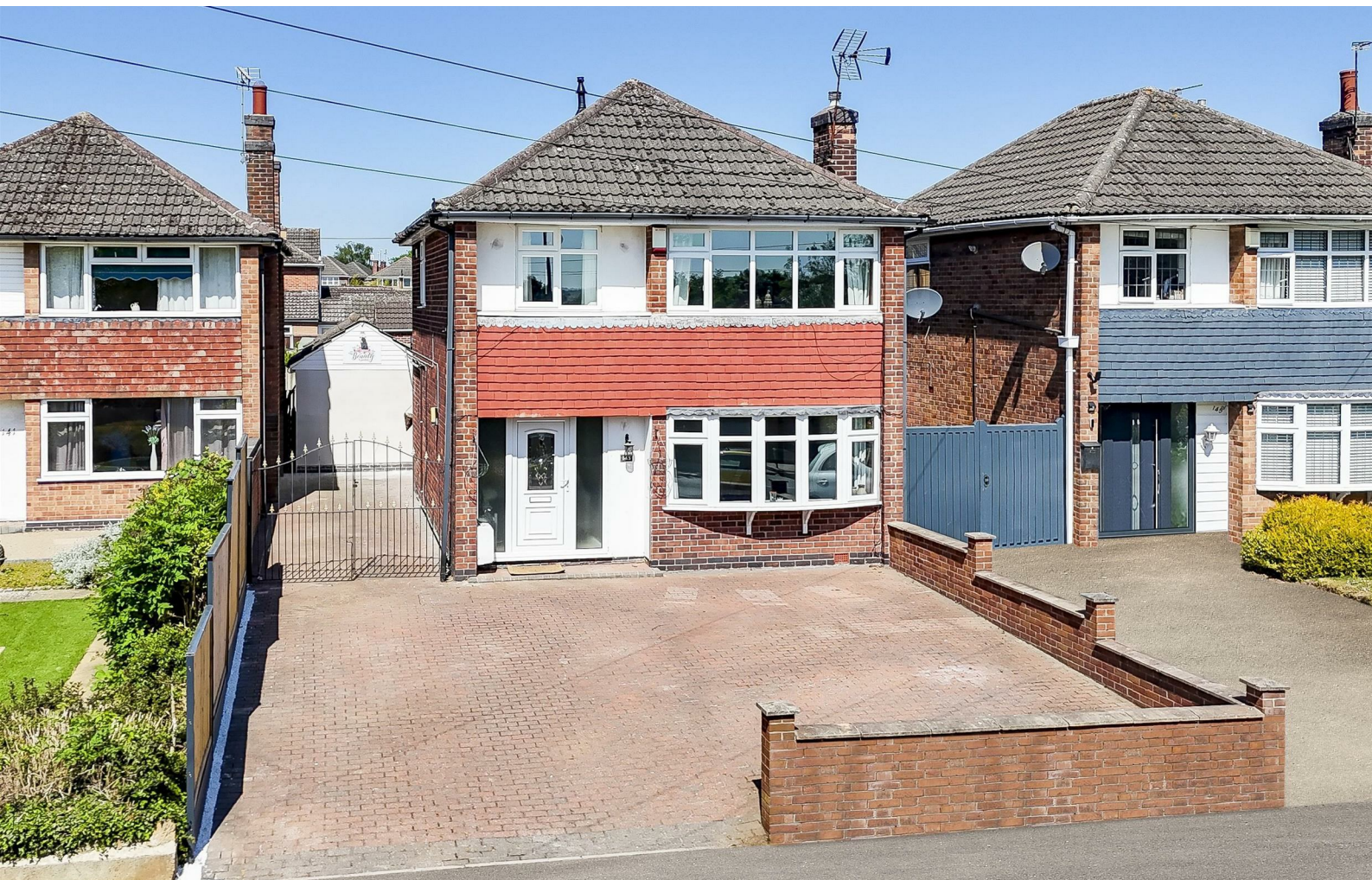
Papplewick Lane, Hucknall, Nottinghamshire NG15 8EJ